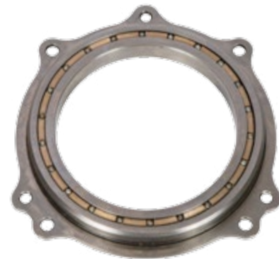
Ball bearing for helicopter gearbox

Cost reduction and improved product performance go hand in hand in today's competitive global market. It drives innovation. Your customers demand it of you, We accept nothing less from ourselves. The result? Around the world, our customers' market successes continue to achieve new heights.