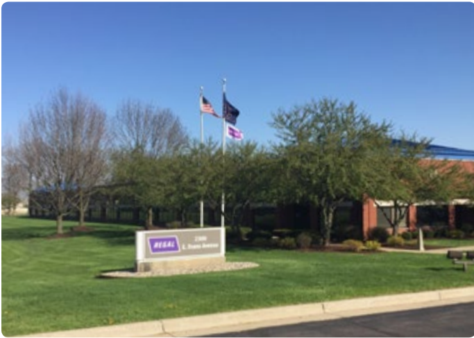
Manufacturing facility in Valparaiso, Indiana USA

Simulate, prototype, validate – as a manufacturer of custom products, these are core functions at McGill. Our staff of experts in metallurgy, heat treating and tribology is complemented with a comprehensive test laboratory where we can simulate many types of aerospace and industrial environments. Just a few include chemical exposure, extreme temperatures and accelerated-life. Our engineers analyze the interaction of lubrication, surface finishes and contamination, all to provide compliance with project requirements.