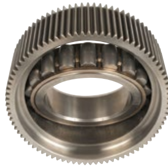
Geared outer race spherical roller bearing for planetary gearbox