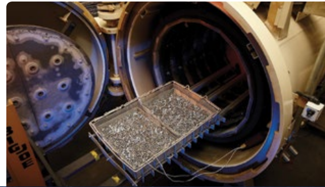
Vacuum heat-treat furnace

McGill manufacturing process control begins with the arrival of raw materials at our plant. Adherence to specifications is stressed from beginning to end. We utilize industry leading inspection technology, whether in-process or offline. Our fully equipped metrology and metallurgical labs help ensure that materials, components and finished assemblies meet all project requirements.