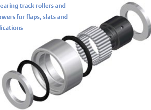
Needle bearing track rollers and cam followers for flaps, slats and seat applications

McGill has extensive experience processing aerospace materials for custom bearing applications. Specialty steels are used for high temperatures, additional corrosion resistance, extended operating life and other customer-specific application conditions. Other McGill material innovations include use of PEEK (polyetherketone) as a weight reducing alternative for retainers in transmissions. Challenges demand innovations. Bring your bearing challenges to McGill.