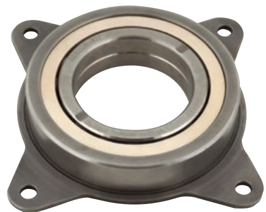
Gothic-arch ball bearing for helicopter gearbox applications