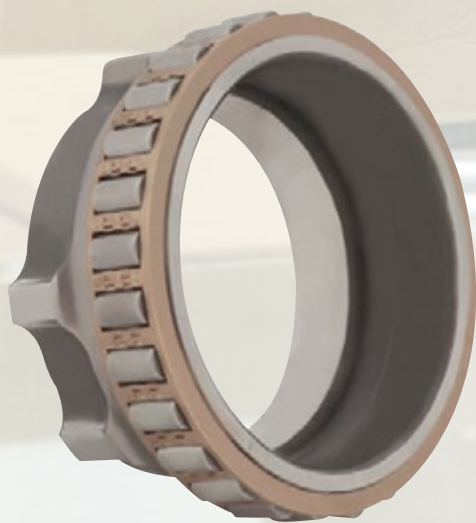
Cylindrical roller bearing for hydraulic pump application

Critical bearing applications require customer service that is “above and beyond,” and that is what you’ll experience with McGill. We strive to anticipate your needs. We understand there is no room for second place. Our sales and service team sets the industry standard for professionalism when it counts most.